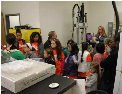
Girls at the Oct 2014 DYW Conference learn about bone strength testing!