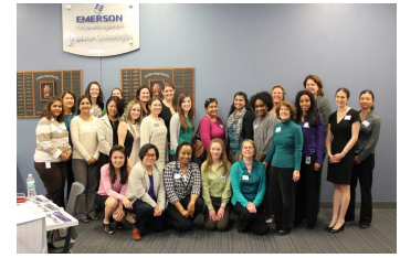
Images from the Emerson and Halliburton Events