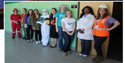
Ladies of Dallas SWE in the March 2015 Design Your World Engineer Fashion Show

SWE is the driving force that establishes engineering as a highly desirable career for women through an exciting of training and development programs, networking opportunities, scholarships, outreach and advocacy activities, and much more.