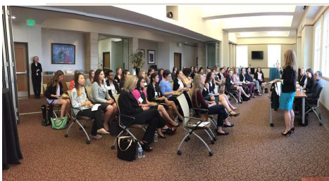
She Networks, She Wins! at SMU